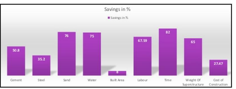
Figure.5. Histogram showing the comparative savings between rapid wall and conventional construction

The histogram given in Fig. 5 reveals a massive savings in materials, time, weight and cost due to Rapid wall adoption are as follows: cement (50.80%), steel (35.20%), sand (76%), water (75%), built area (8%), labour (67.59%), time (82%), weight of super structure (65%) and construction cost (27.47%).